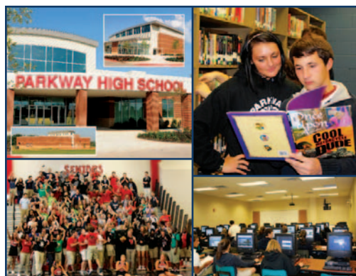
Parkway High School

It is more than the start of a new year at Parkway High School; there is the smell of varnish, walls with fresh paint and the sight of a construction worker or two still putting the finishing touches to a new 200,000 square foot facility that is state-of-the-art. Five years ago, the Bossier Parish School Board called for a bond issue that included building this new high school. After securing 40 acres of land and holding meetings with architects and engineers, construction of the facility, and a busy summer of moving, the new Parkway High School is a reality. The new facility provides more than 70 classrooms all under one roof. With its modern hard-wired and wireless internet and zoned video surveillance, it is truly a 21st Century School!